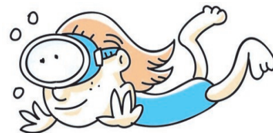
Ulmarra and Friends Swimming Carnival Place Getters