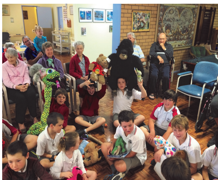
RATHGAR LODGE Teddy Bear's Picnic 2/9/14